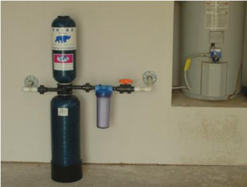
Whole Home Filter System