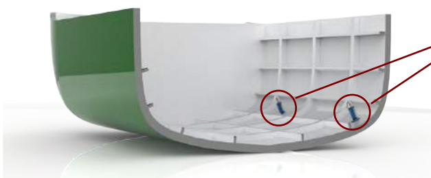
Ecohull installation in a ship hull

Each Ecohull system can control areas up to 10m/30ft in diameter