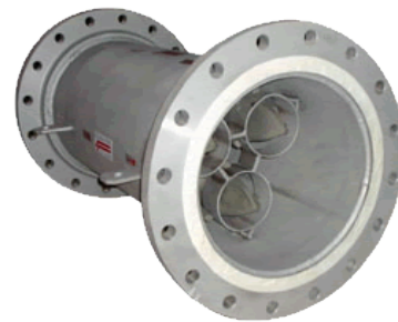
16" diameter unit shown

Colloid-A-Tron sizes range from 2" to 72" diameter